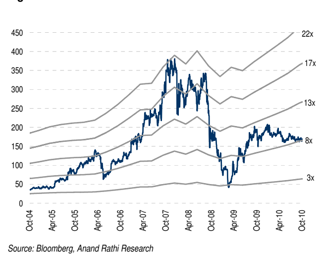
Fig 4 – PE Band